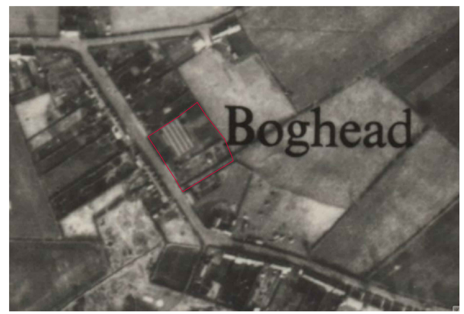
Aerial Photos 1944 - 1950 National Library of Scotland