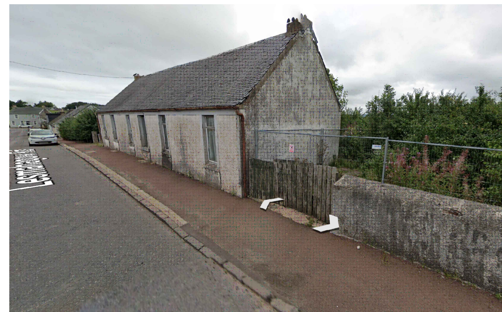
Site as Existing (Lesmahagow Road)